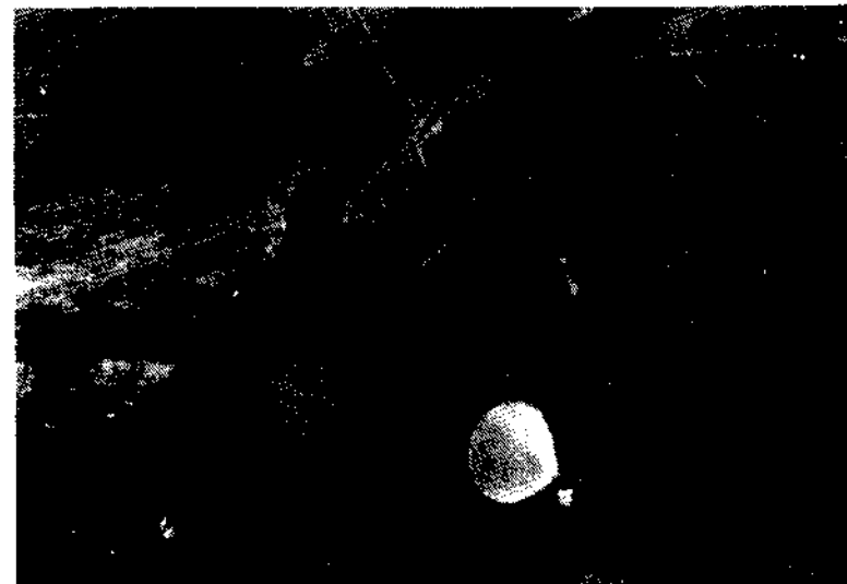
Wind Trap No. 2 on the north face of the road cutting, viewed from above.