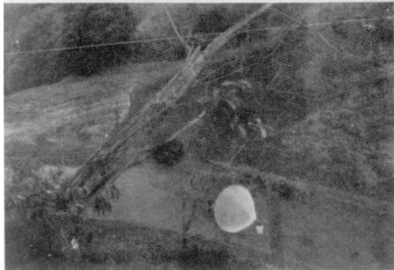
Wind Trap No. 2 on the north face of the road cutting, viewed from above.