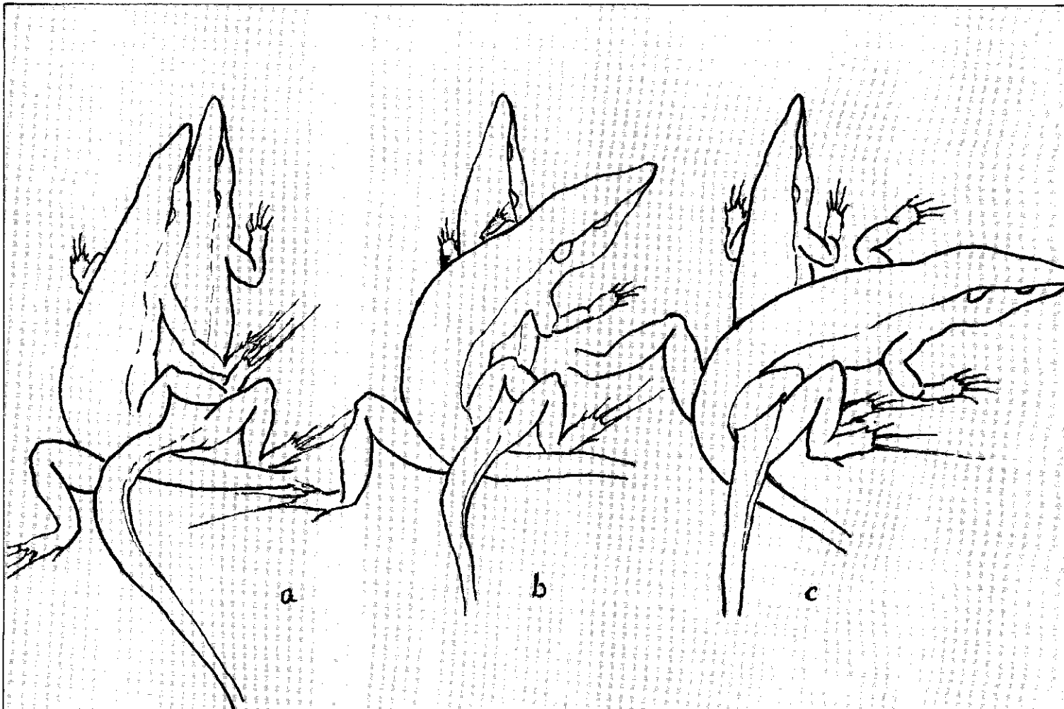
Fig. 2. The change of position observed in some copulations. Note the movement of the male over the female and the lowering of the female's tail.